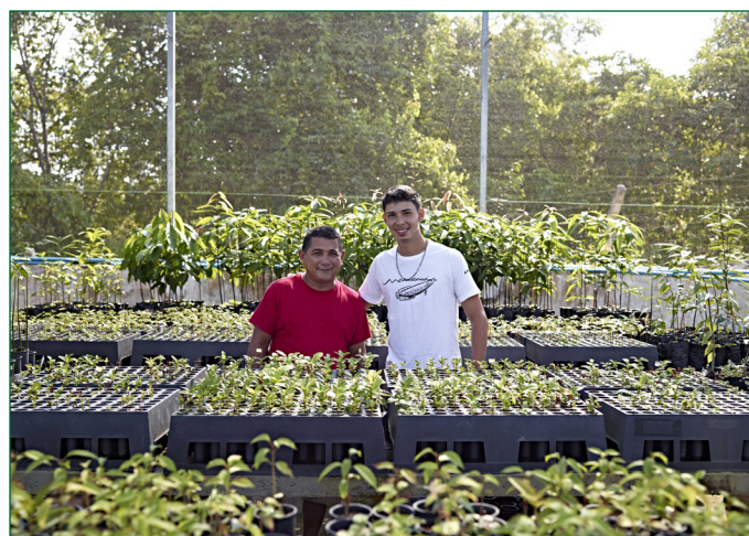
The Mamirauá Institute is responsible for one of the projects presented in the film

The film was released at COP21, held in Paris, and is now available on the Amazon Fund's site ( http://www.amazonfund.gov.br/ ) and on BNDES's YouTube channel, in Portuguese and English. In addition to the full version, which is eight and a half minutes long, an abridged version of four minutes was edited.